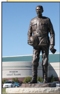
Museum of Great Plains

Lawton is located in the heart of the Great Plains Country, an area well known for its abundant lakes and world-class fishing and hunting. Mount Scott , which rises 2,500 feet above the plains, provides some of the most breathtaking scenery in the state and a chance to view free-roaming bison, longhorn cattle, white tail deer and elk. The Wichita Mountains Wildlife Refuge , established in 1901, provides a habitat for large grazing animals on its 59,020 acres. The refuge is also home to approximately 400 species of animals, birds, reptiles and amphibians, and more than 800 plant species.