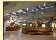
Museum of Great Plains