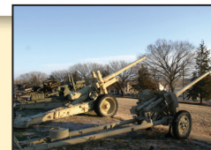
Cannon Walk at Fort Sill