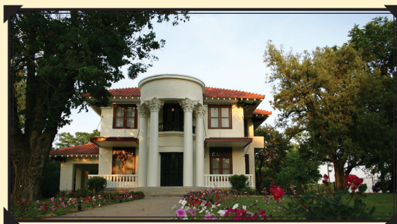
Mattie Beal Home