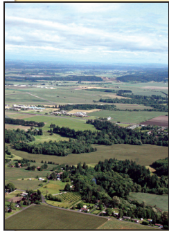
Aerial of McMinnville

Located in the heart of Oregon's wine country, the community of McMinnville combines small-town charm with easy access to the many attractions of nearby metropolitan areas. The dynamic city of Portland is only 38 miles away, and the state capital, Salem, is a 30-minute drive.